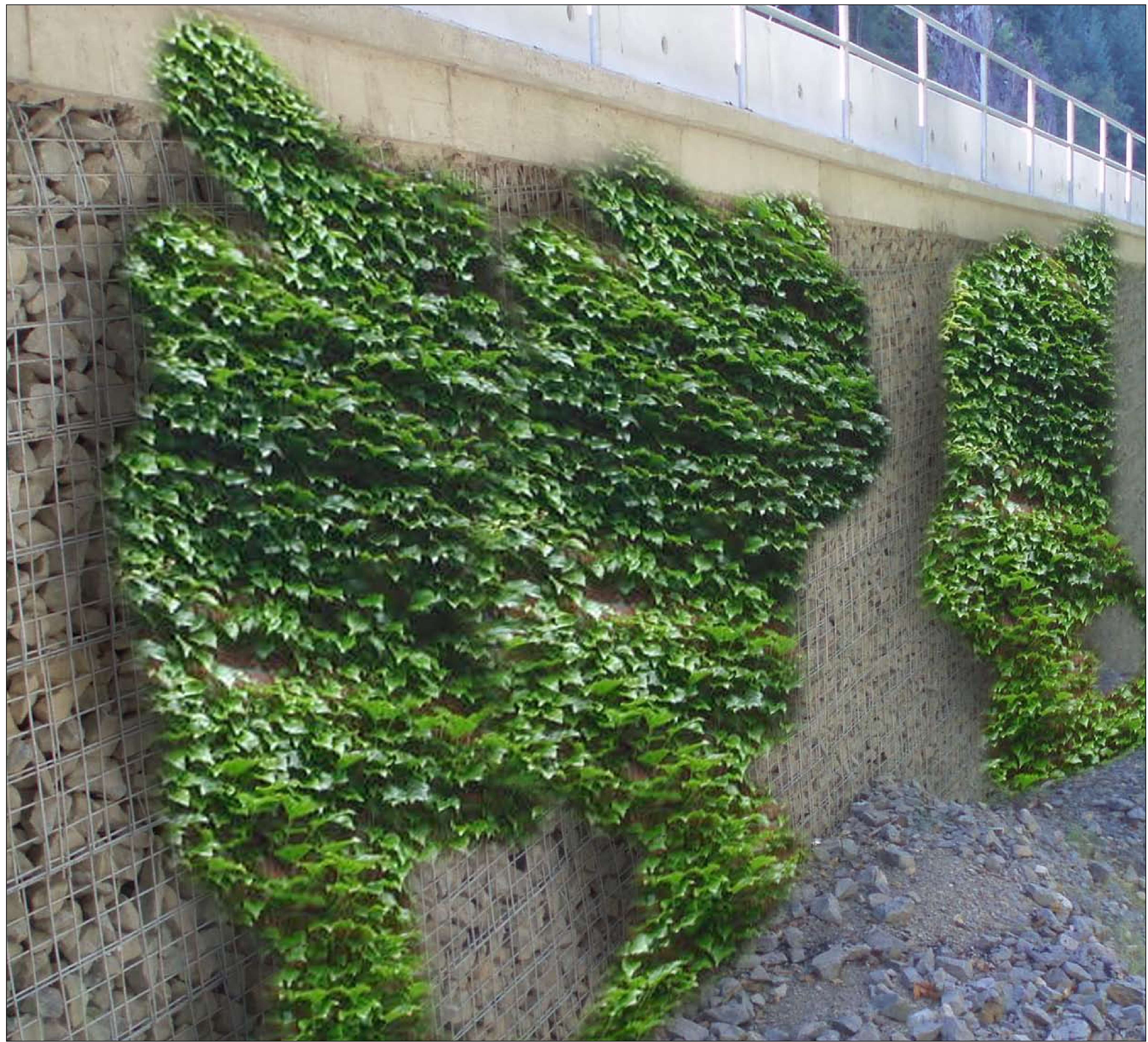
Wire Retaining Wall with Boston Ivy Planting