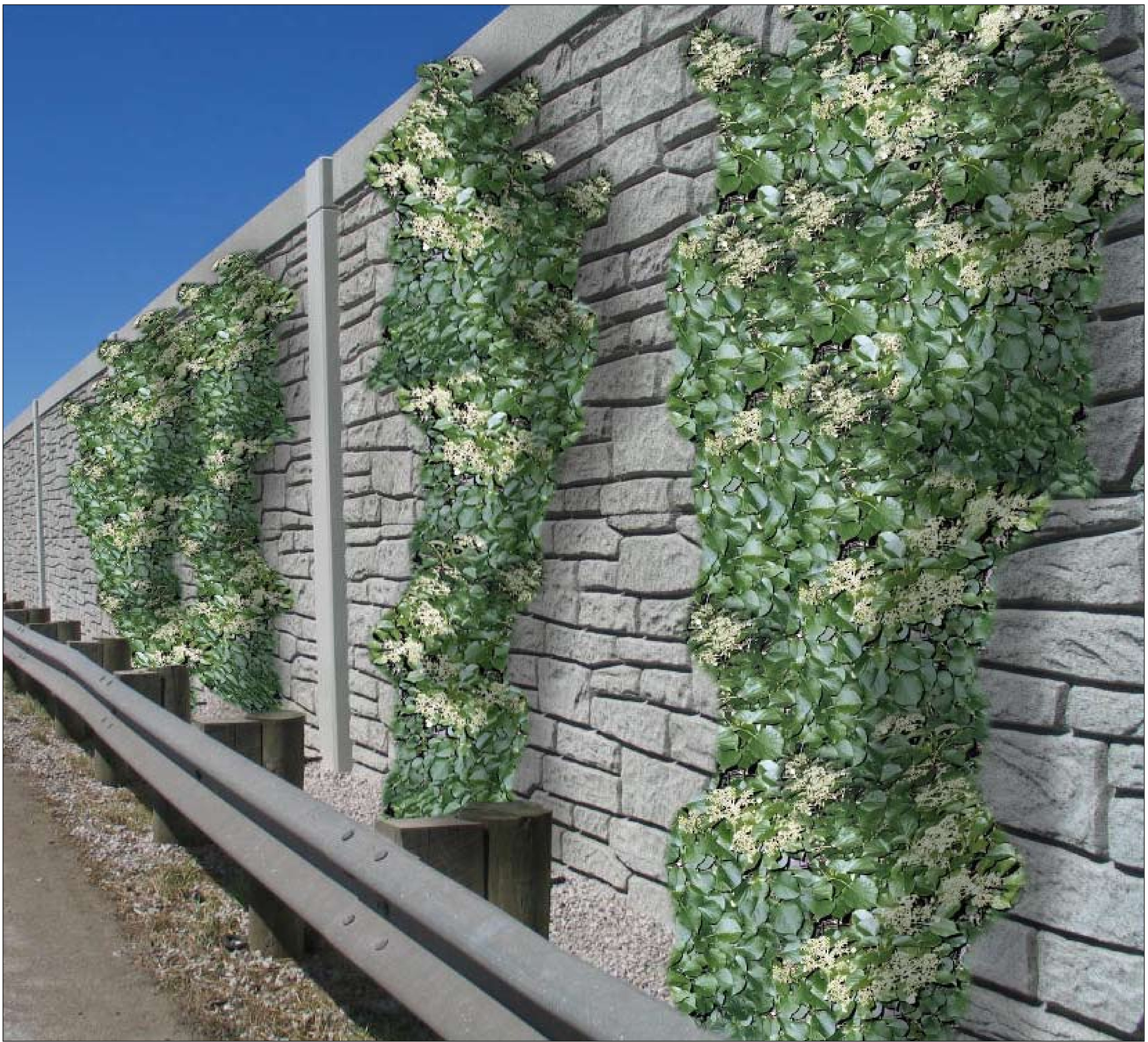
Noisewall with Climbing Hydrangea Planting