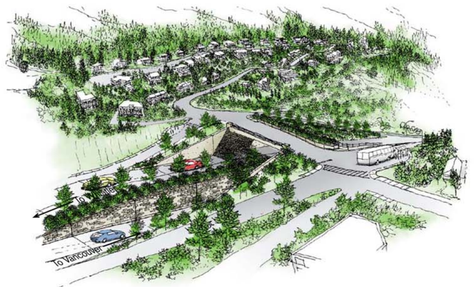
Kelvin Grove Mini-Change Southbound View