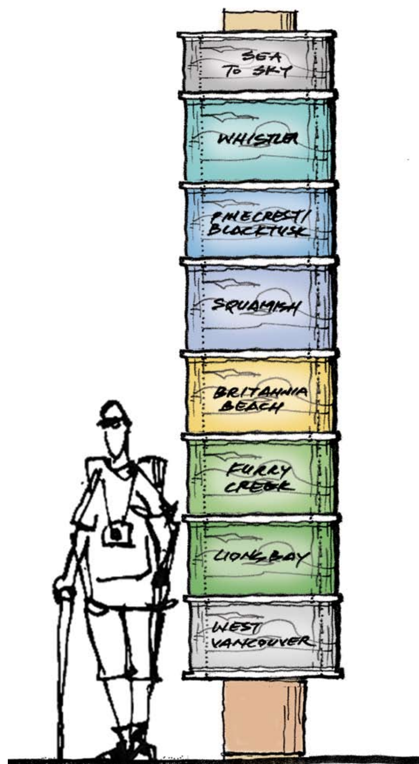
Community Rings Option