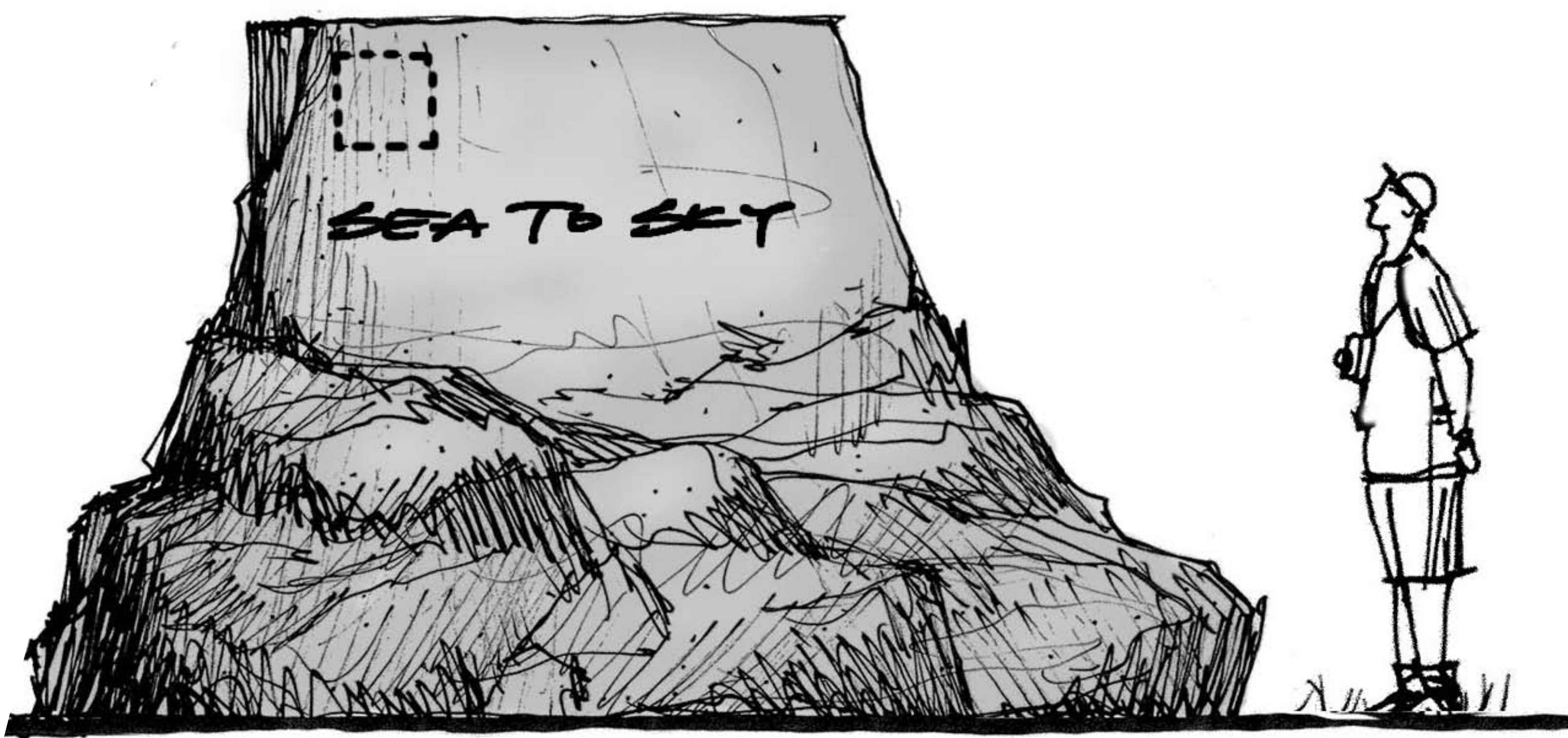
Community Rocks Option